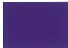
19. Royal Blue