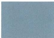
18. Blue Grey