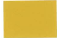
10. Reef Gold