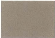
6. Turtle Brown