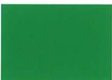
27. Mint Green