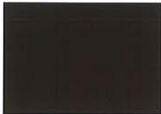
12. Ebony Black