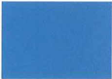
11. Cobalt Blue