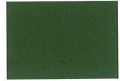
5. Forest Green