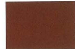
25. Chocolate Brown