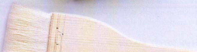
SG612 Clear Gloss